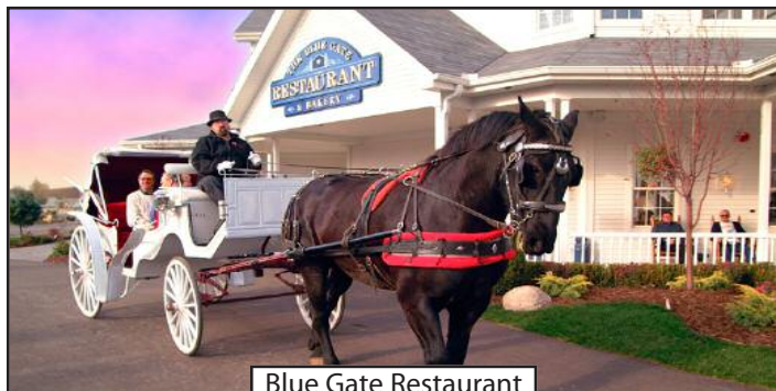
Blue Gate Restaurant