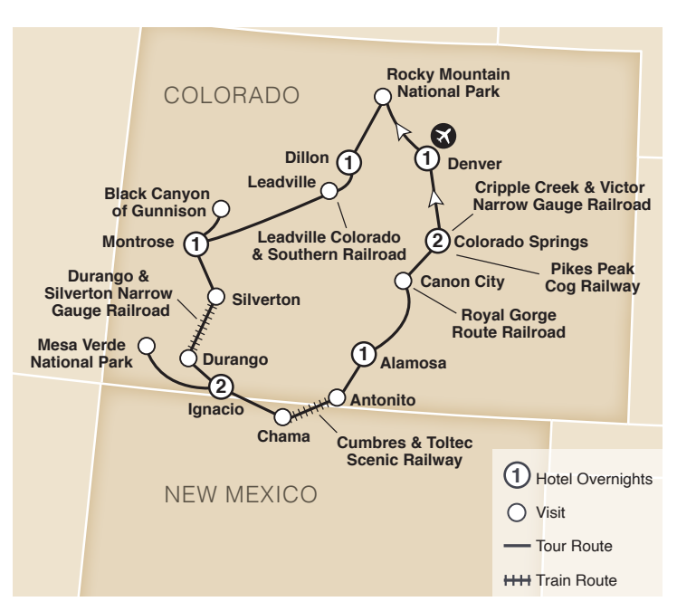
DAY 1 Arrive in Denver: Welcome to Denver, the "Mile High City." Meet your fellow travelers at 5:00 p.m. for a getacquainted dinner hosted by your Tour Manager. Meal: D

DAY 2 Rocky Mountain National Park: Departing Denver, venture into Rocky Mountain National Park, a living showcase of the grandeur of the Rocky Mountains. With elevations ranging from 8,000 feet on the wet, grassy valleys to 14,259 feet at the weather-ravaged top of Longs Peak, the park is filled with breathtaking scenery and experiences. Following the Trail Ridge Road a stop at the Alpine Visitor Center offers an opportunity to learn more about this fascinating place. Meal: B