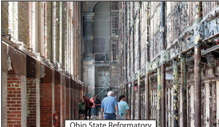
Ohio State Reformatory

Presented by: Frenchtown Center for Active Adults