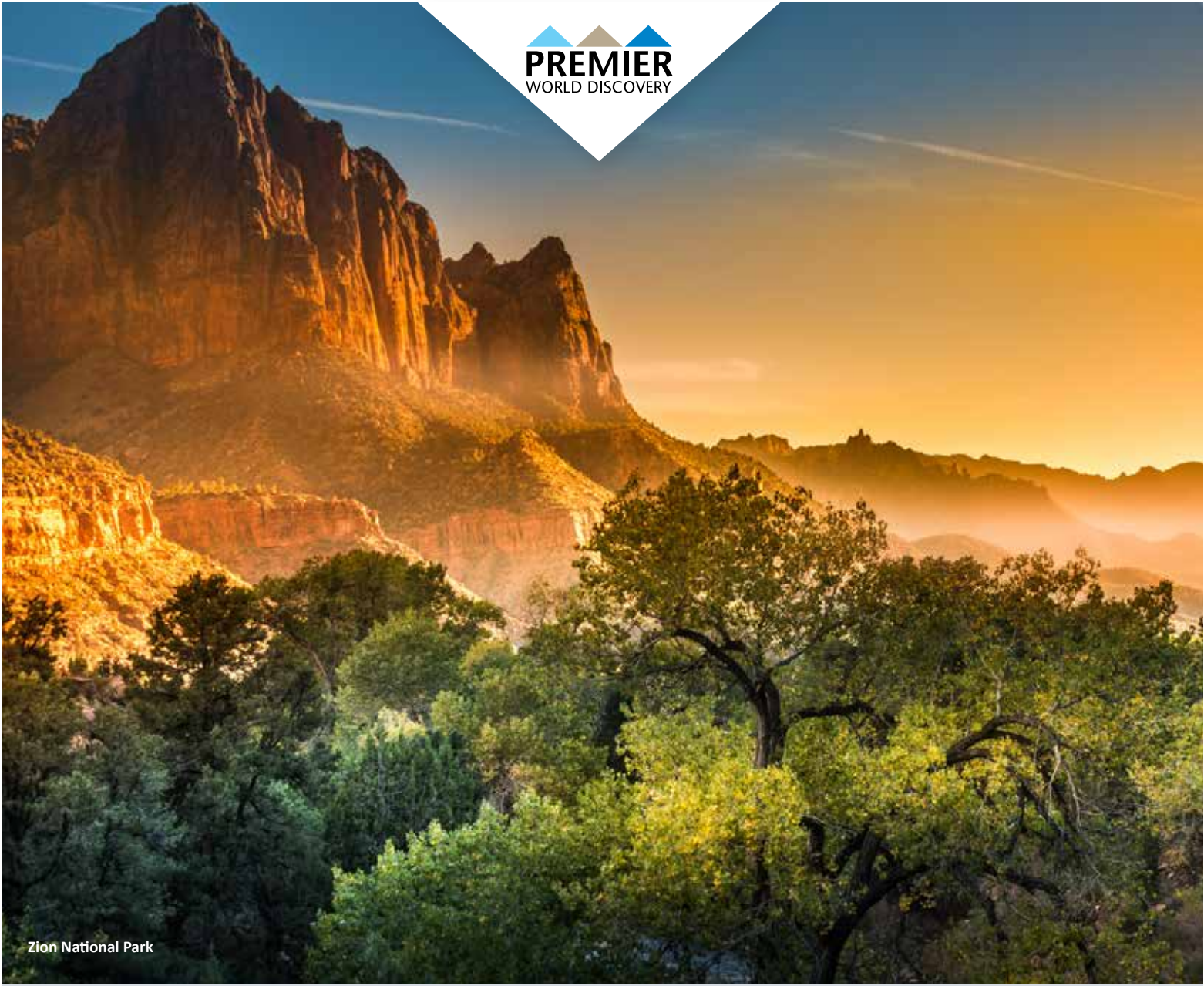
Zion National Park