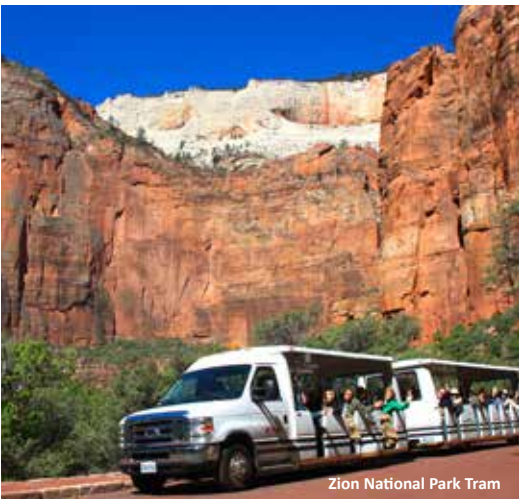
Zion National Park Tram