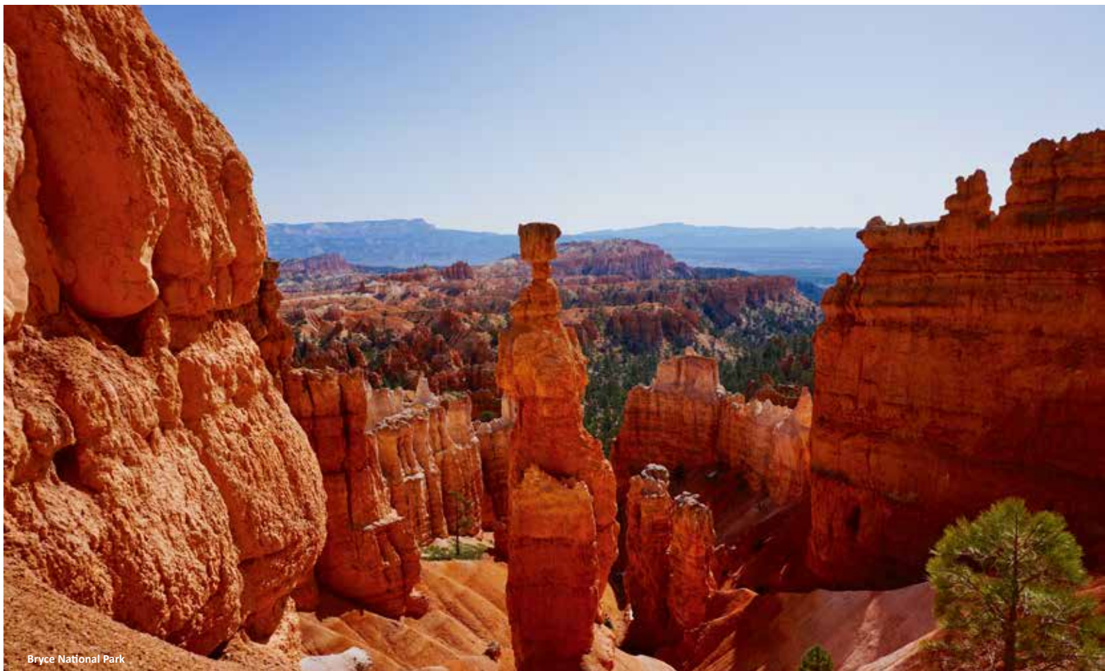
Bryce National Park