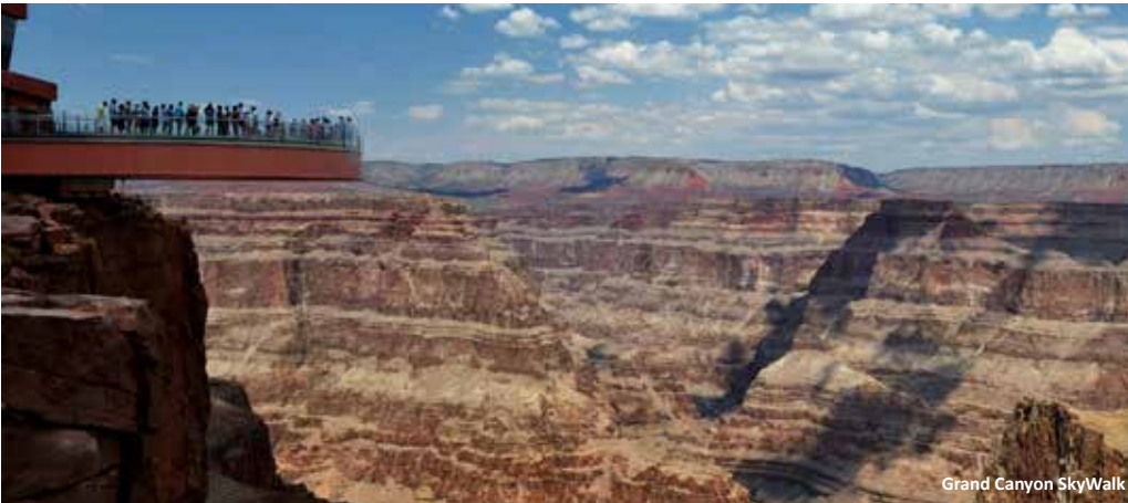
Grand Canyon SkyWalk

region of contrasts, from the Mojave Desert at 2,000 feet to the 10,000-foot Pine Valley Mountains. The crown jewel of the area is Zion National Park , one of the oldest & most scenic National Parks in the United States. Enter the park in Springdale and experience a Zion Park Tram Tour to view the spectacular combination of multicolored canyons, sheer cliffs, streams, waterfalls and foliage that are all part of this beautiful park's backdrop. Later visit the historic Zion Lodge, the hub of this wonderful National Park. After your Zion experience, enjoy a Farewell Dinner at a local restaurant in the Zion Park area. After dinner return to Mesquite.