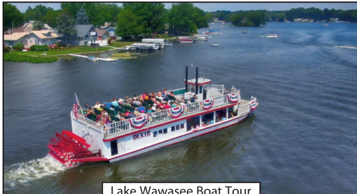
Lake Wawasee Boat Tour

Presented by: Frenchtown Center for Active Adults